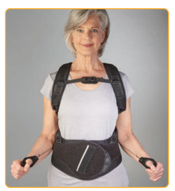
Dual Power-Pull Closures deliver effective compression