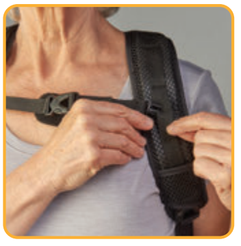
Sternum strap is adjustable and removable