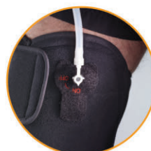
Valve On/off valve allows for easy inflation and deflation