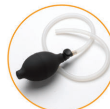
Bulb Features button for quick deflation