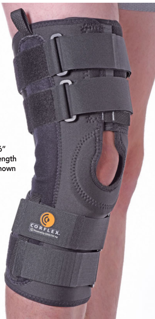
16" Length Shown

The CoolTex Ag hinged knee brace offers comfortable support with the added convenience of easy application. Brace features bilateral range of motion hinges delivering full flexion and extension control with settings at nine ROM options. Top finger loops allow for simple pull-on application and adjustment during wear while the release tabs on the hook closure aid in brace removal.