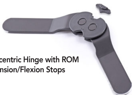
Polycentric Hinge with ROM Extension/Flexion Stops